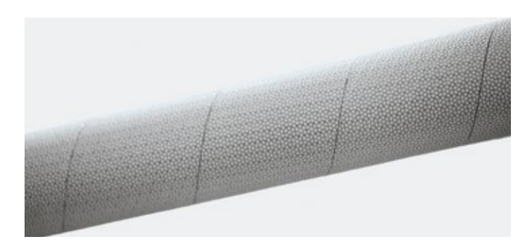
Complete roller spiral wrapped, providing grip and a nonstick surface.